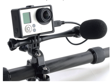
* Every device must supply PlugIn-Power

The microphone is powered from the device to which it is connected, so no additional battery is required.